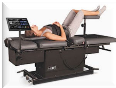
Hill DT Solutions Decompression Table